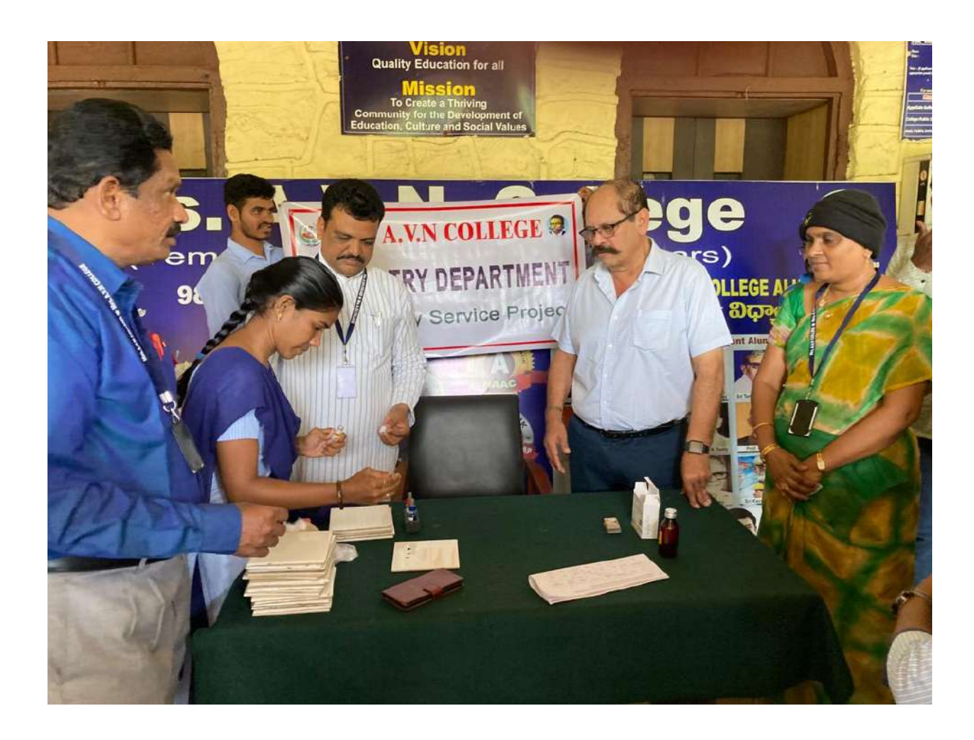
Training & certification