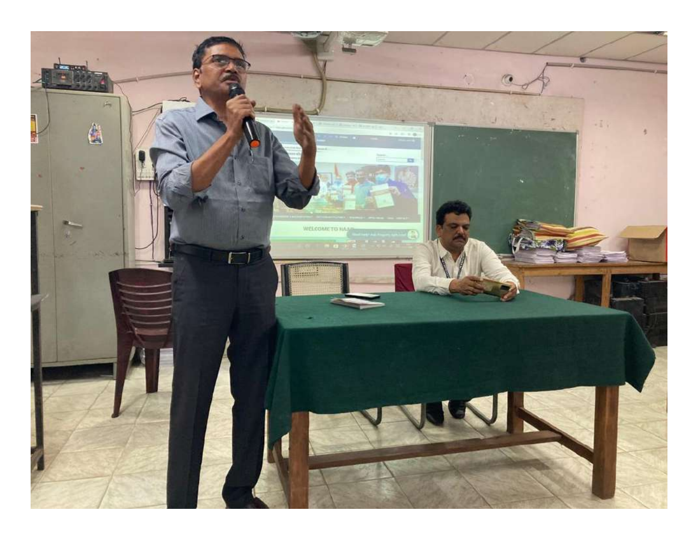
Blood group- profiling